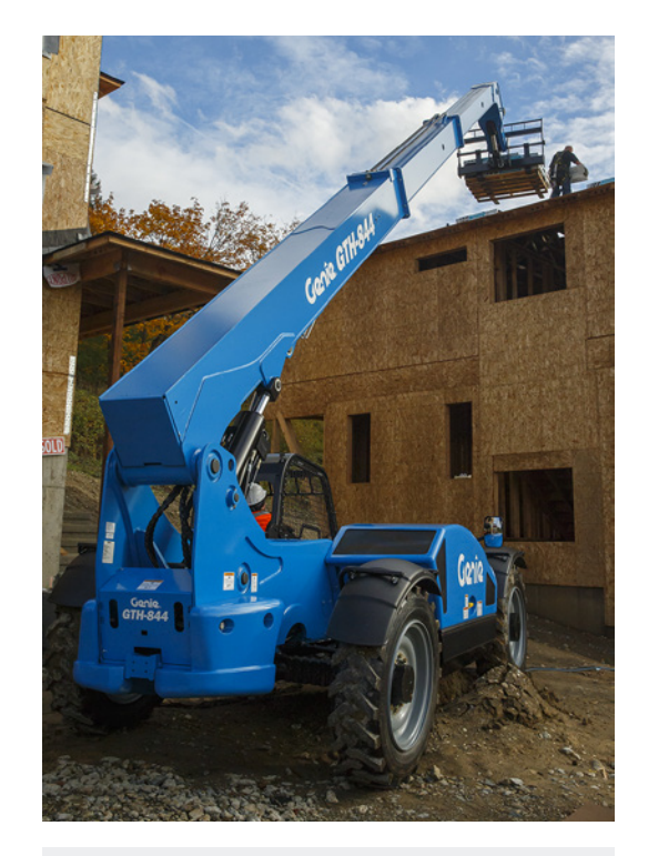
Long Life Tires